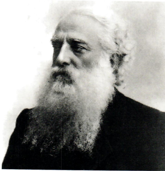
Olcott as an older man, years after his arrival in India in 1879

The outer evidence of it is to be seen in the rebuilding of old shrines, . . . the larger offerings made to the Temples. Within the Buddhist Church the revival is signaled by a greater number of ordinations held with greater publicity, the care with which the Buddhist doctrines are being taught in the Pali language in the Vidyodaya College and in the monasteries, and the preparation of Buddhist Catechisms in the native and even in the English language.